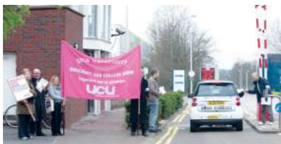
Photo from MKNEWS 23 March 2011—the picket line at the Open University as UCU members hand out leaflets.