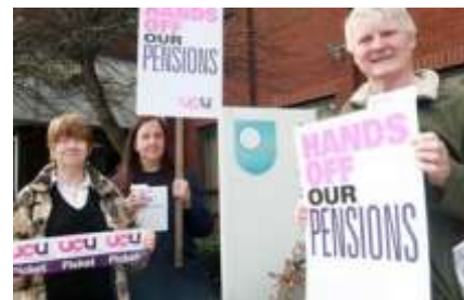
Photo from the East Grinstead Courier & Observer: http://bit.ly/dWOpwU

From the East Grinstead Courier & Observer